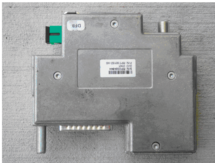
Figure #1 HEFN**** Return Path Transmitter