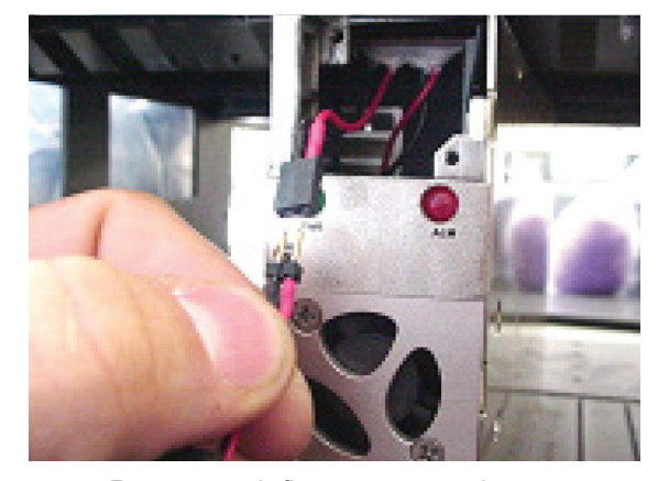
4. Remove push-fit power connections.