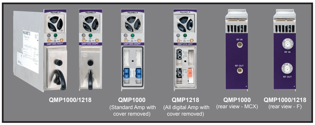
Figure #2: Front & Rear Panel Pictures

Initially, when inserted in the Active MAXNET II Chassis, the amplifier will start alarming (the front panel ALM (Alarm) LED indicator will start flashing red), as there is no RF input signal. The amplifier will stop alarming once RF signal is applied to the input and all other parameters are within operating conditions.