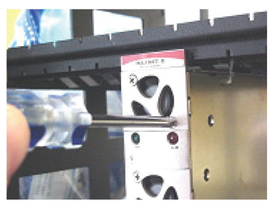
1. Remove two screws holding plate and fan in place.

Check to see if the module fan is operating. If not replace with a new fan from ATX (Fan Part #: MPFANA) using the below procedure.