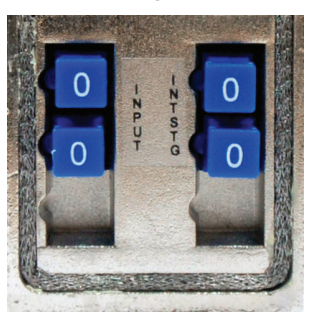
Figure #3: Front Panel Plug-in's

The QMP200 Amplifier plug-in padding and plug-in equalizer are accessible by removing the front cover. Remove the access cover from the front of the QMP200 Amplifier module by turning the thumbscrew counter-clockwise. This will expose two blocks of two PAD's/EQ's. The ones on the left side are connected to the RF Input and the ones on the right side are connected to the RF Output.