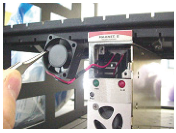
3. Pull out fan with tweezers.