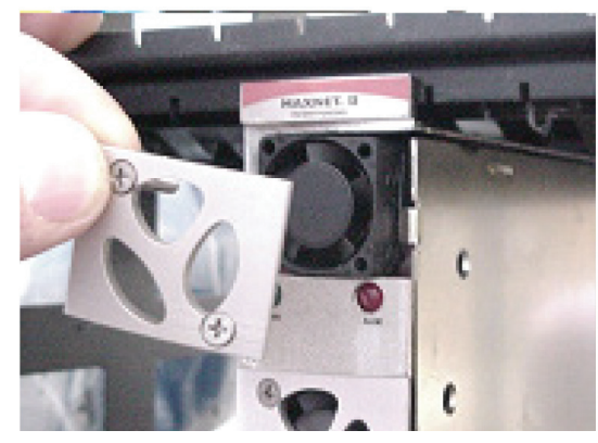
2. Remove fan cover and screws.